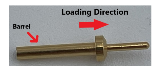
116131P1 Pin Contact