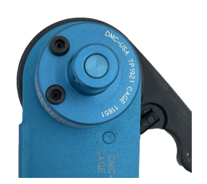
TM0001 with Locator Installed