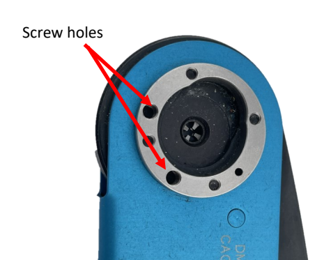
Locator Installation Area