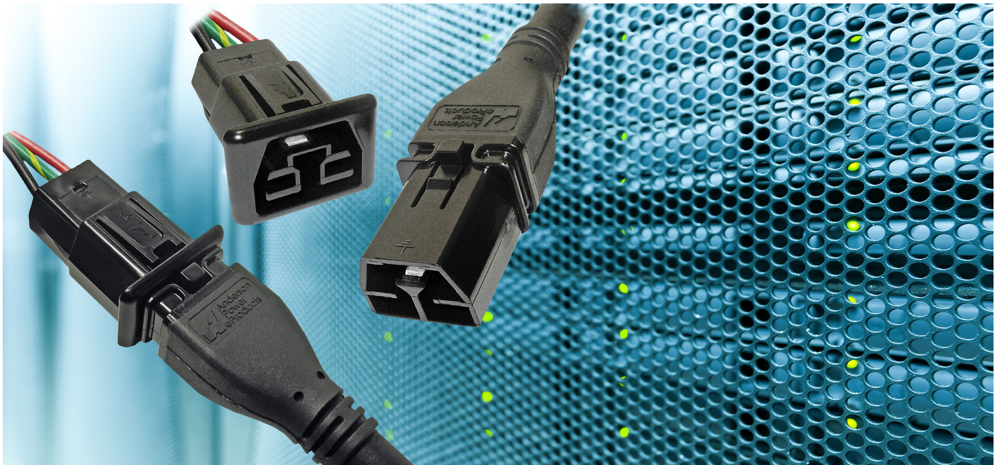
Safety considerations may demand that a connector be touch-proof. APP's SAF-D-GRID® connectors provide touch safety and arc protection for low voltage applications.

Custom solution can be engineered to meet all applicable regulatory requirements. Anderson Power Products® connectors are designed to allow the user to create custom solutions. For example, a wide range of colored housing options can be stacked together to create a reliable custom connector. These housings can be used with different contacts to create wire-to-wire, wire-to-board, or wire-to-busbar connections. With expertise in multiple types of contact technology and molded plastic insulators, the company can provide power connectors built to customer needs.